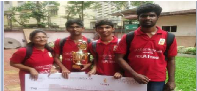
Team ENLIGHTENERS (II year) won cash prize of 50,000 in AI Hackathon at VESIT Mumbai-2019