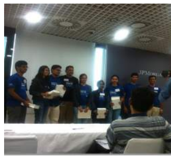
JPMC Code for Good Event Winners-2019 Batch