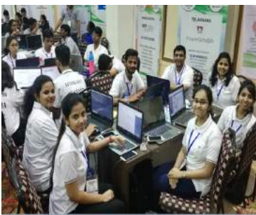
Students participating in Grand Finale of "SMART INDIA HACKATHON-2019" in Bhubaneswar