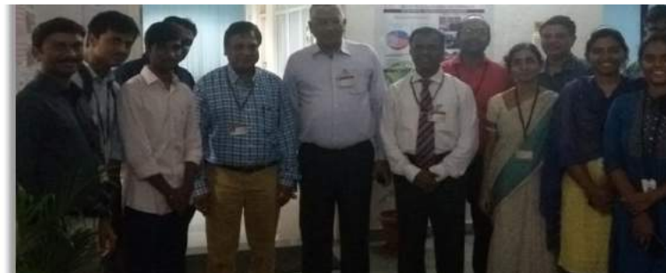
Microsoft selected students with 10.87 LPA-2019 Batch