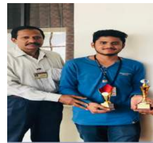
Chess Winner: National Level Sports Fest-2018-19

" Never stop chasing your dreams, it can take you from zero to hero in a fraction of time "