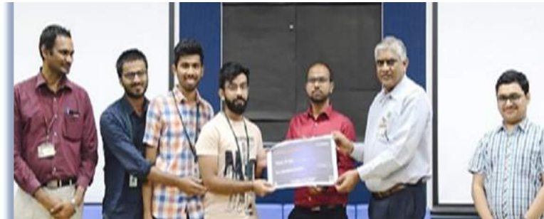
First Prize Winners of Turing Cup 2K19 from VNRVJIET-2019