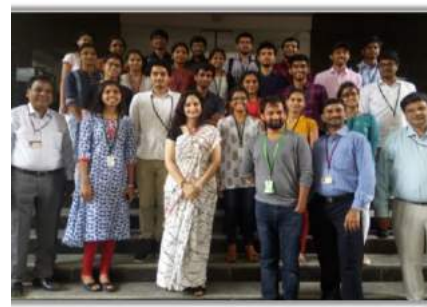
NCR Corporation Team with Selects -2019 Batch