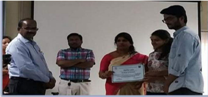
II Year Students Won First and Second Prize in QUEST 2019 at JNTUH