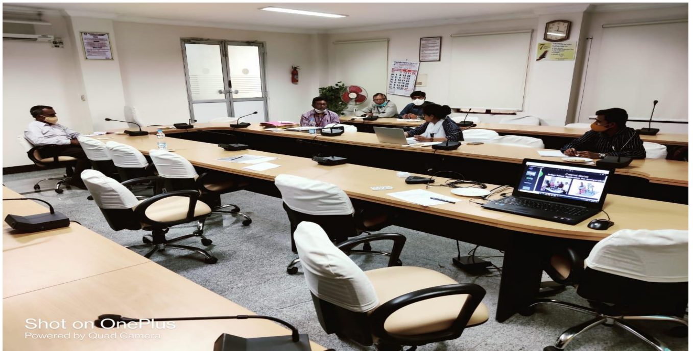
MSME Project Ideas evaluation by the third-party team at Board Room, VNRVJiet on 11-02-2021