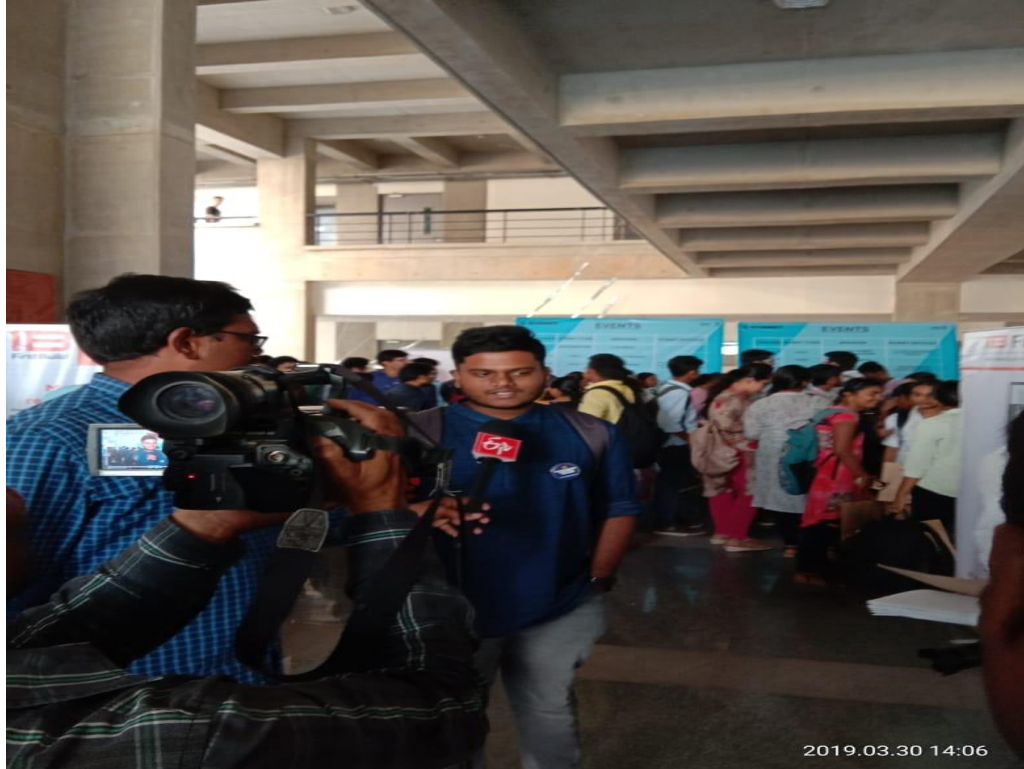
Interaction with the Participants and Media by the students of VNRVJIET at E-Summit at IIT, Hyderabad