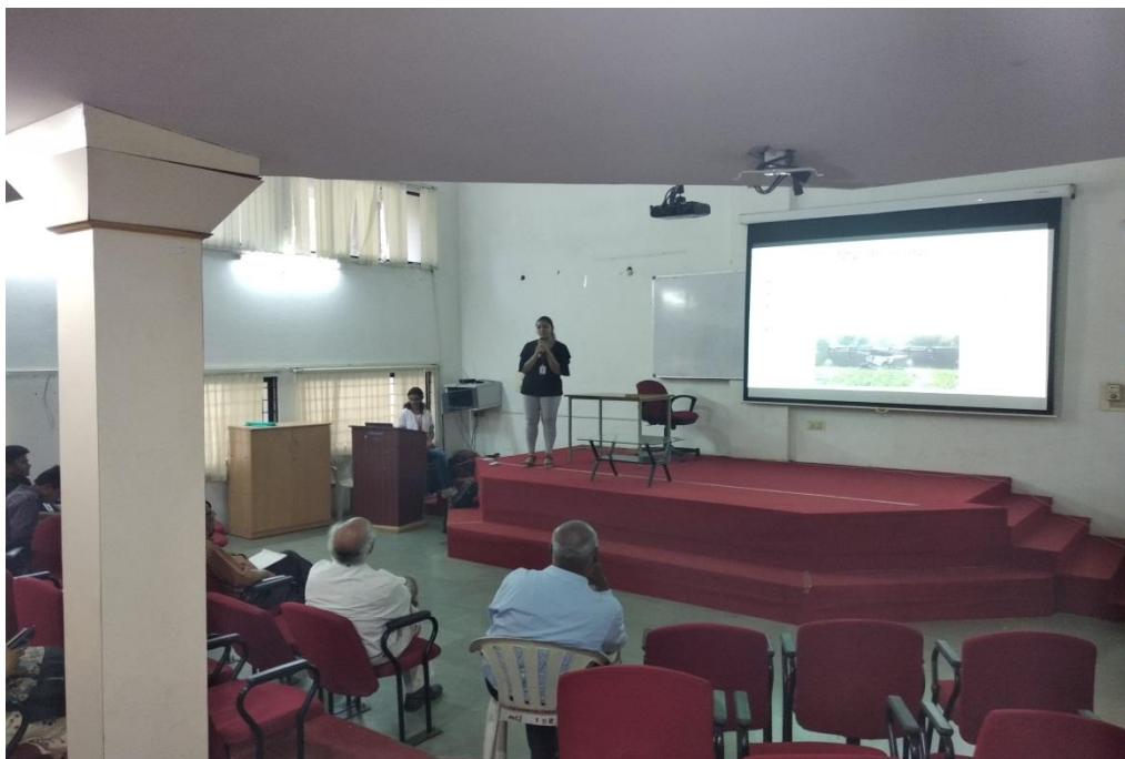
One of the participants presenting their idea in My Big Idea Competition on 06-03-2019 at P.G.Block Seminar Hall