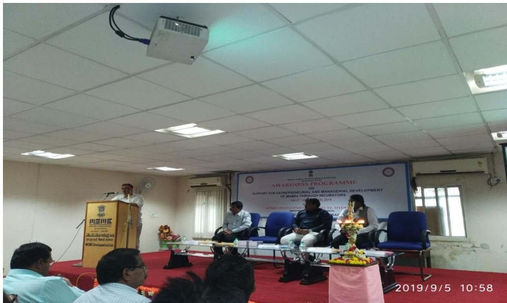
Officers of MSME-DI, Balanagar on the Dias during the Inaugural Session of the Awareness Programme on 05-09-2019