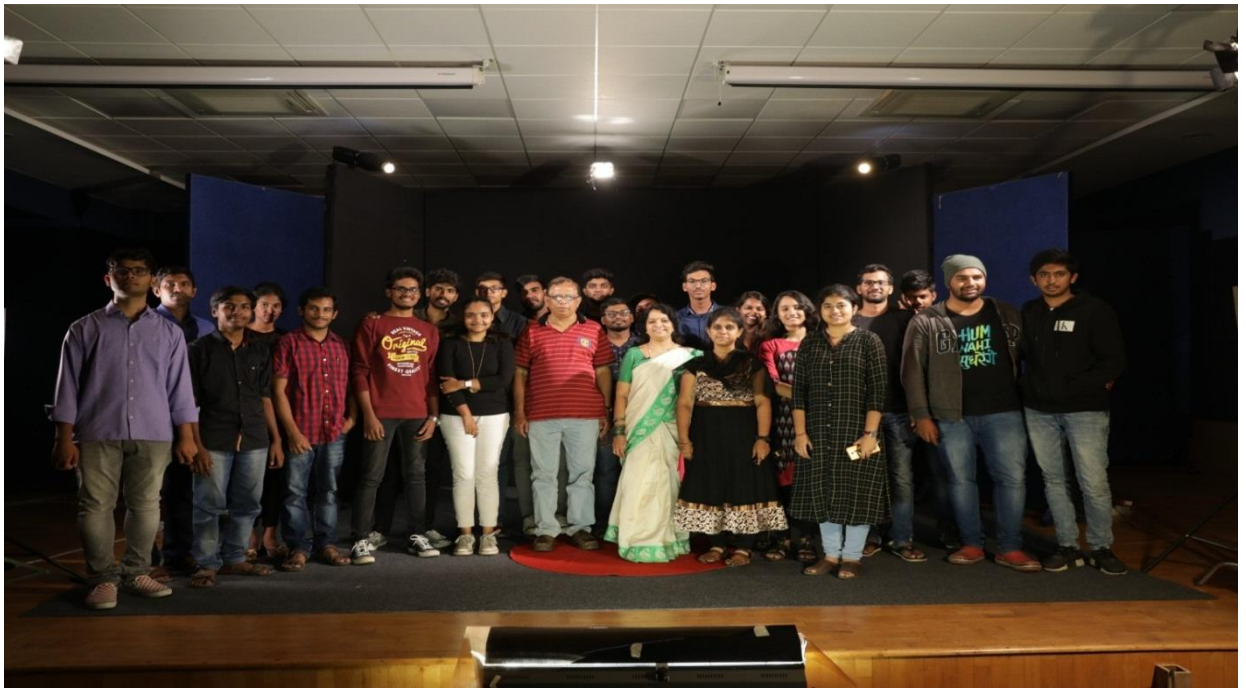
Josh Talks Team and Student Volunteers of VNRVJIET at K.S.Auditorium on 15-09-2019