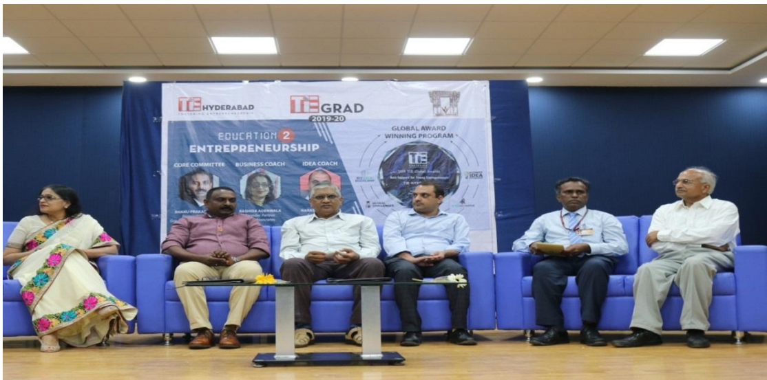
Dignitaries on the Dias during inaugural of TiEGrad-2019 Kickoff Session on 20-09-2019 at K.S. Auditorium