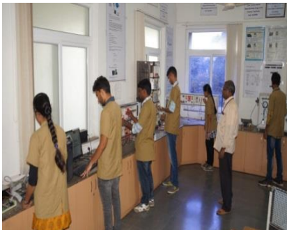
AUTOMATION & ROBOTICS LAB