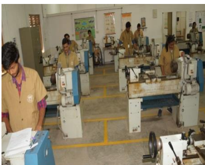
MANUFACTURING PROCESSES LAB