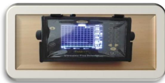
Ultrasonic Flaw Detector